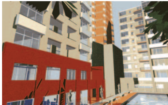
The Oasis 6-18 Poplar, East Sydney 2000 - 154 Units