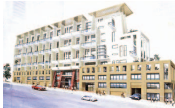
Manhattan 1 Poplar St, East Sydney 1996 - 62 Units