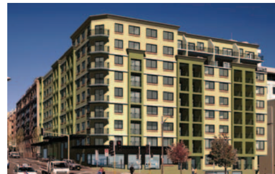
The Bauhaus 209-221 Harris St Pyrmont 2002 - 133 Units