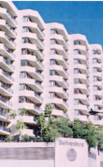
The Belvedere 160 Goulburn St Sydney 110 Units