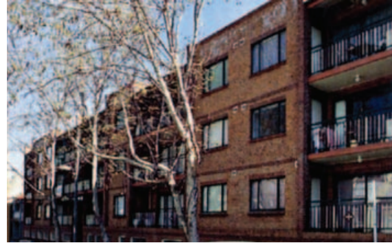
The Nickson 9 Nickson St, Surry Hills 1994 - 33 Units