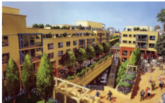
John Street Square 20 John St, Pyrmont 1998 - 87 Units