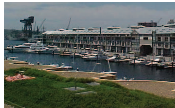
The Wharf 6 Cowper Wharf Rd Woolloomooloo 2000 - 311 Units

Gemini Property Project Marketing • Acquisitions • Commercial & Industrial