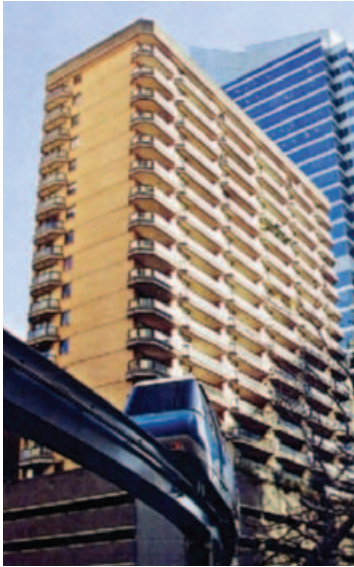
The Berkeley 25 Market St, Sydney 1982 - 127 Units