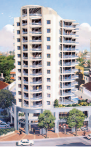
Harbourview 257 Oxford St Bondi Junction 1998 - 71 Units