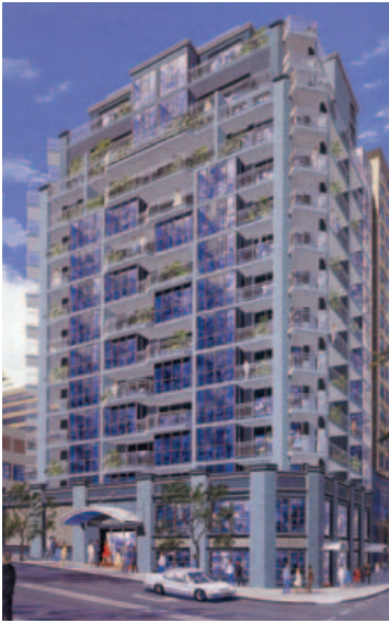
The Domain 22 Sir John Young Cr Woolloomooloo 1995 - 109 Units