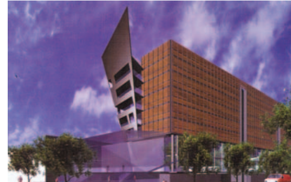
Alpha G 11A Lachlan St Waterloo 2003 - 75 Units