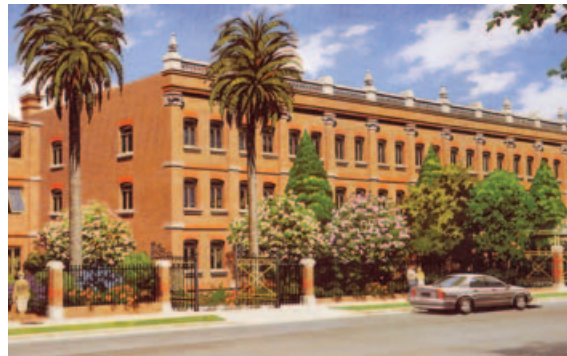
The Piano Factory 45 Trafalgar St, Annandale 1999 - 131 Units