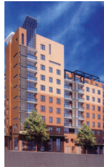
Viva 646 Harris St, Ultimo 2003 - 48 Units