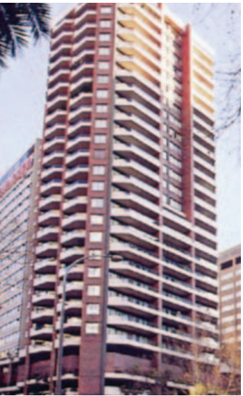
The York 5 York St, Sydney 1981 - 150 Units