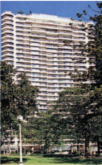
The Connaught 187 Liverpool St, Sydney 1984 - 237 Units